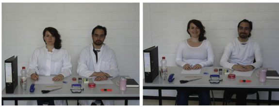
Fig. 2. Committee of the TSST (left side) and friendly TSST (right side). The two members of the committee act in a cold and reserved manner during the TSST but act friendly and openly during the f-TSST. In both paradigms typical office objects are located on the table which are in part manipulated by the committee members in a standardized fashion (central objects) or are just displayed without being used (peripheral objects). Printed with permission of the two former lab members acting as committee members.